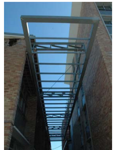
J18 North canopy steel