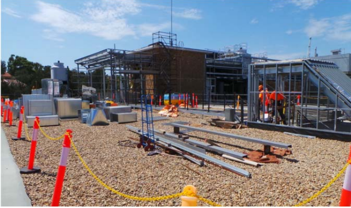
J17 North roof