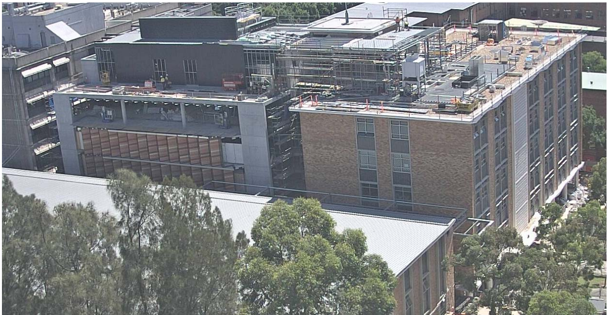
View of the Precinct from the Civil Engineering Building