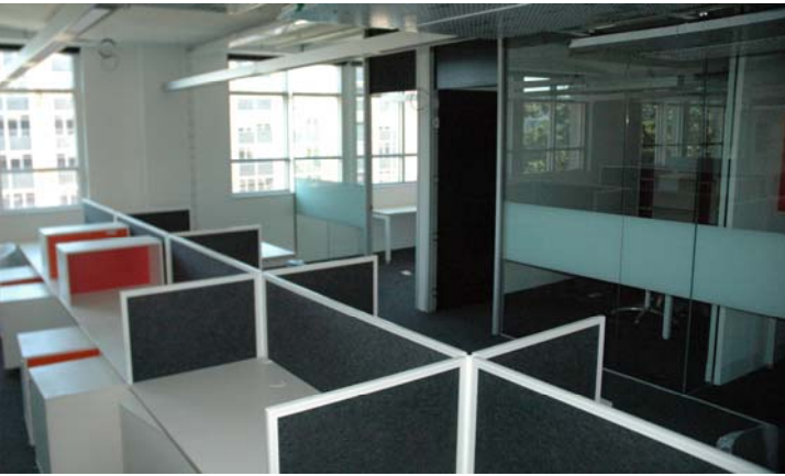
Level 2 open plan office space