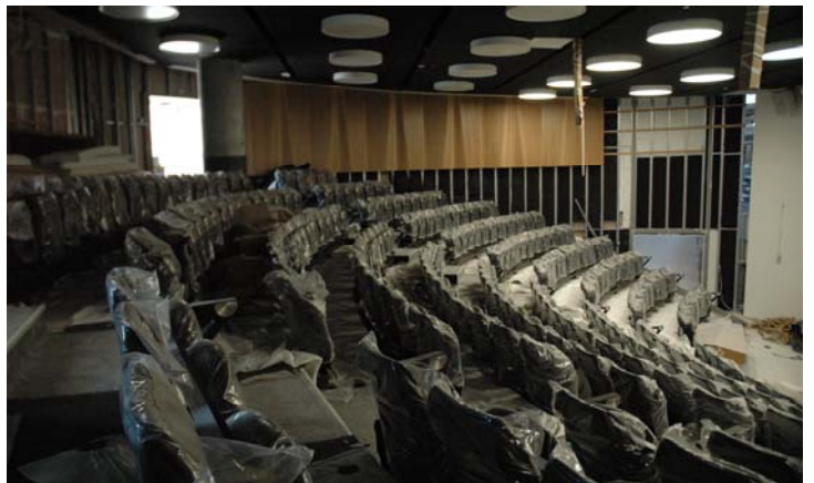
350 seat lecture theatre