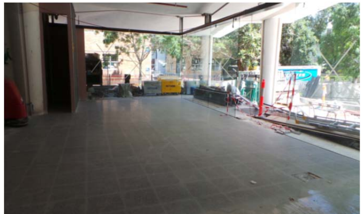
Ground floor cafe area