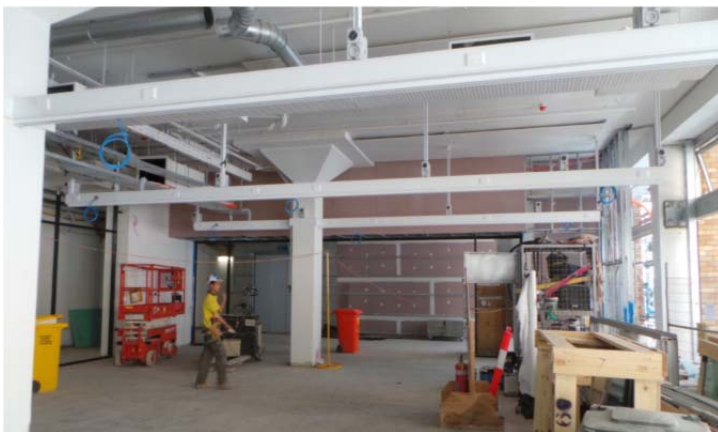
Level 1 laboratory space